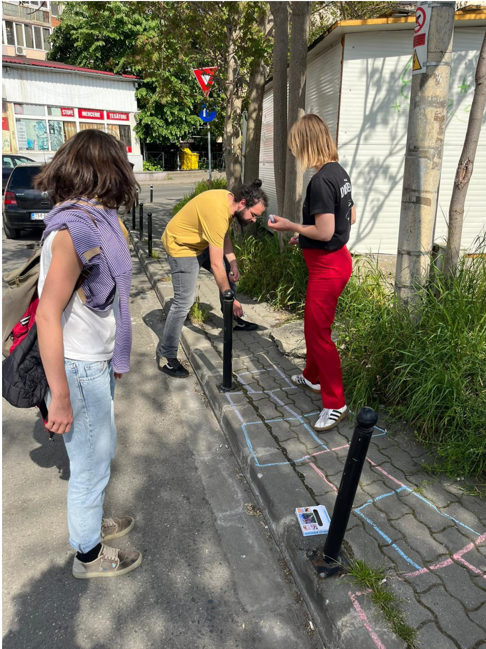
Interventions by mixed groups at Dâmbovița-Flavia neighborhood. 10-05-2023