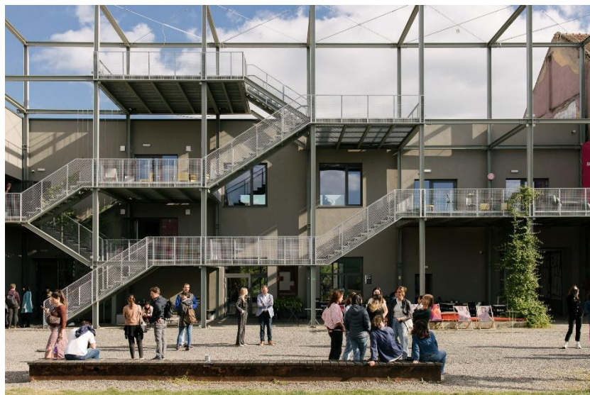
Plai Cultural Center, 08-05-2023