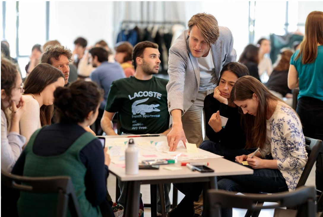
Plai Cultural Center. 11-05-2023