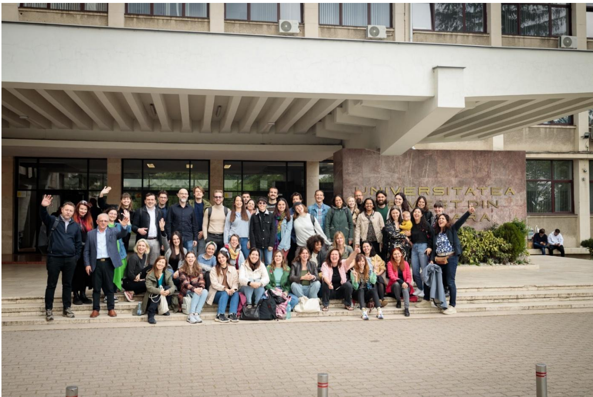
West University of Timisoara. 09-05-2023

The day ended with a guided tour by P8 WUT, with a vaporetto on the Bega canal, during which the urban development of the city influenced by this canal was presented, as well as the typologies of spaces likely to be regenerated in the short and medium term.