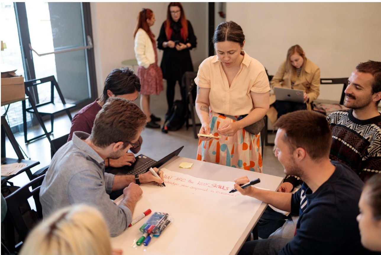
Plai Cultural Center. 11-05-2023

In the second half of the day field visits took place, coordinated by the three partners in Timisoara. The ISHO regeneration project (in the former wool processing factory) was visited, including the art gallery that was created there. Students had a chance to meet the representatives of the ISHO regeneration project and cultural activities and ask questions. Then the Museum of Public Transport was visited, including Multiplexity, under the coordination of Timisoara City Hall, in the process of regeneration and cultural orientation. Last but not least, in the Fabric district, the students interacted with the staff of the Office for the Rehabilitation of Historic Monuments (of the Timișoara City Hall), where they discussed strategies and practices through which historic buildings can be rehabilitated.