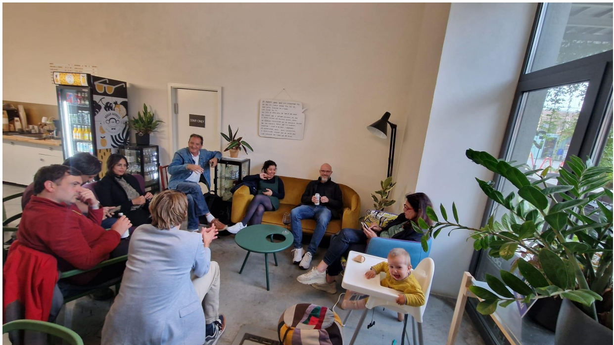
Plai Cultural Center. 12-05-2023