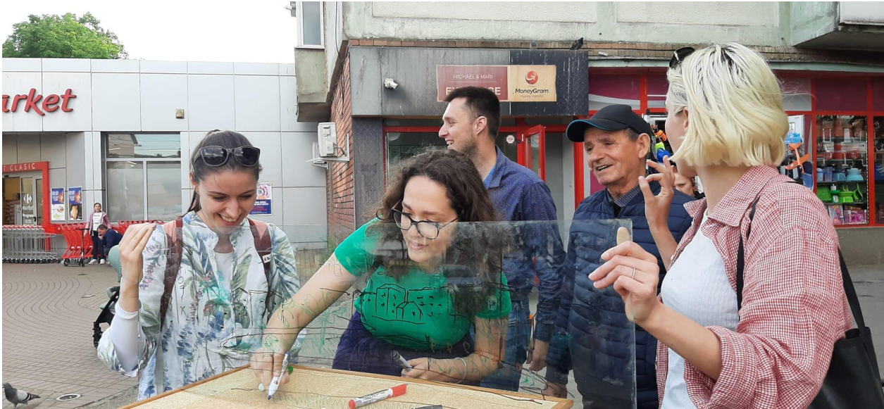
Interventions by mixed groups at Dâmbovița-Flavia neighbourhood. 10-05-2023