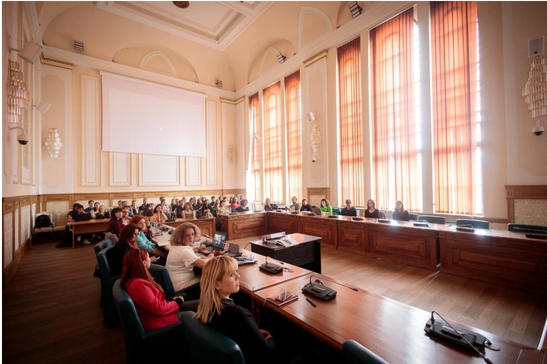
Timisoara City Hall. 09-05-2023