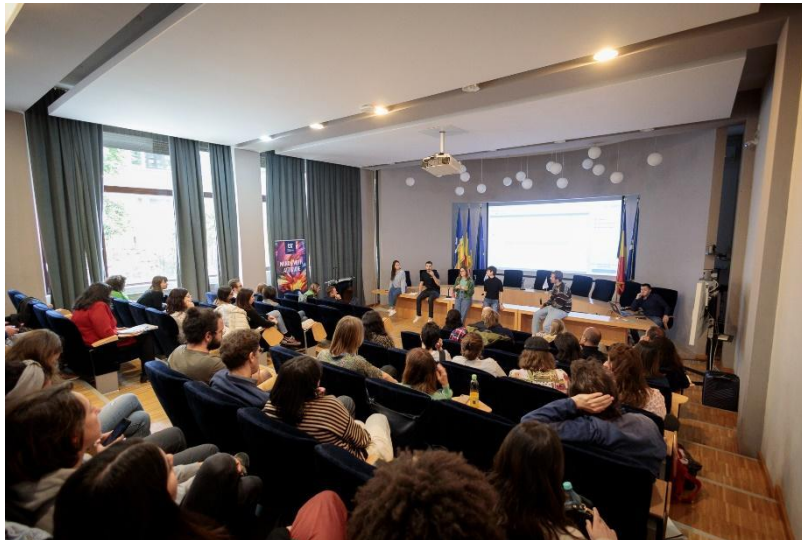
West University of Timisoara. 09-05-2023