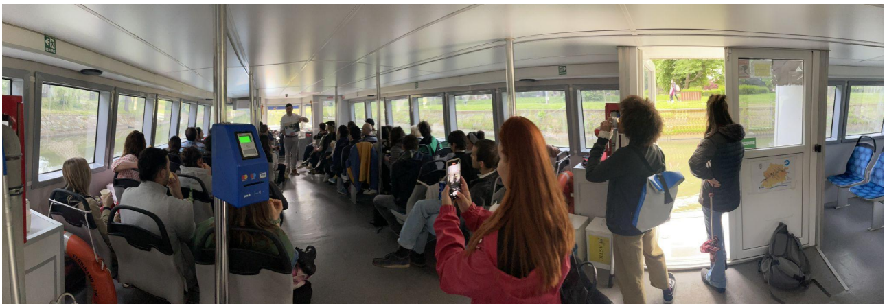
Vaporetto on the Bega canal. 09-05-2023