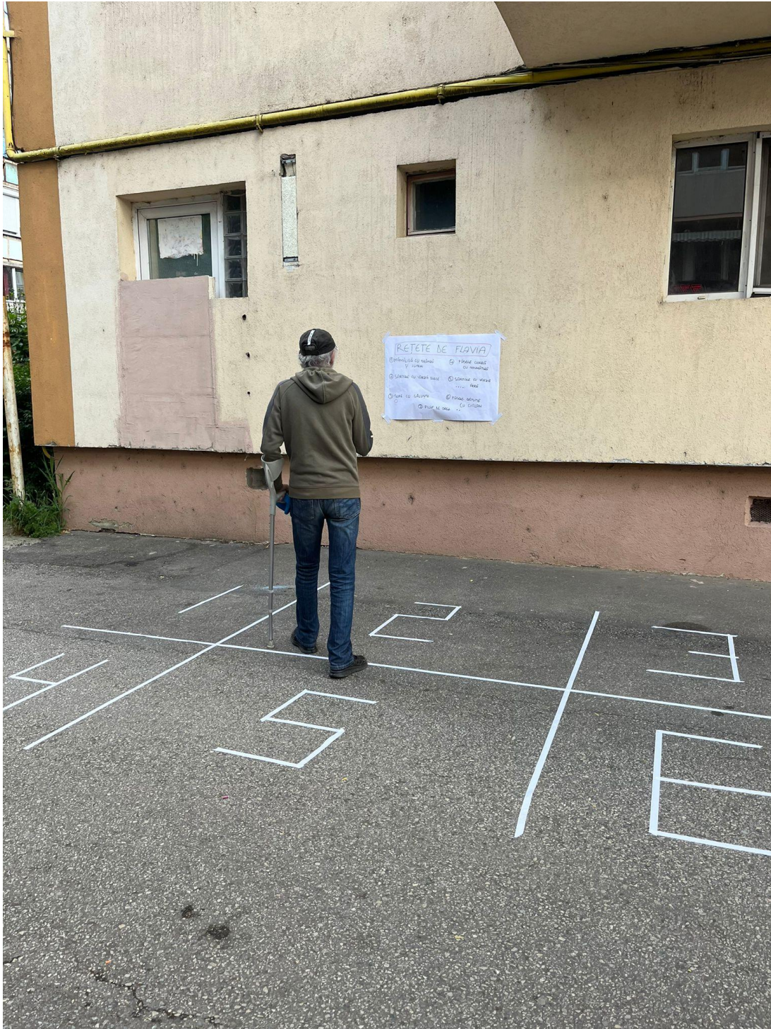
Interventions by mixed groups at Dâmbovița-Flavia neighborhood. 10-05-2023