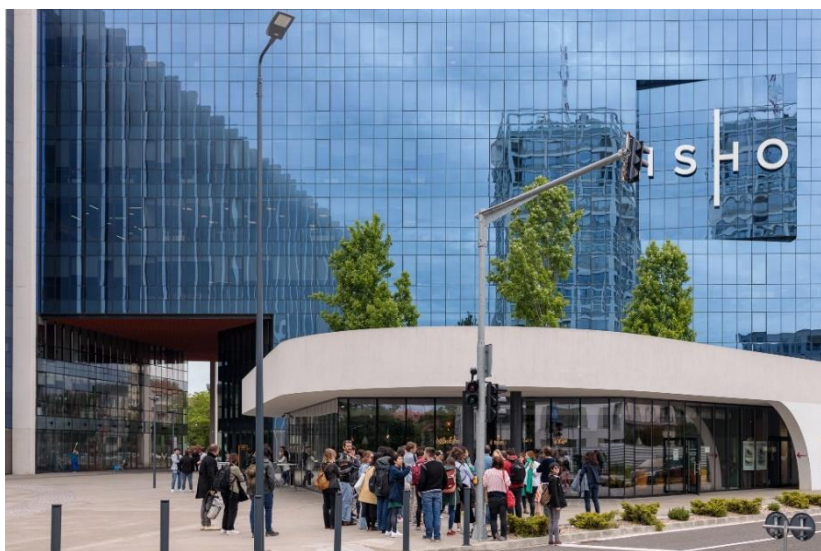
ISHO regeneration project and Art Encounters exhibition. 11-05-2023