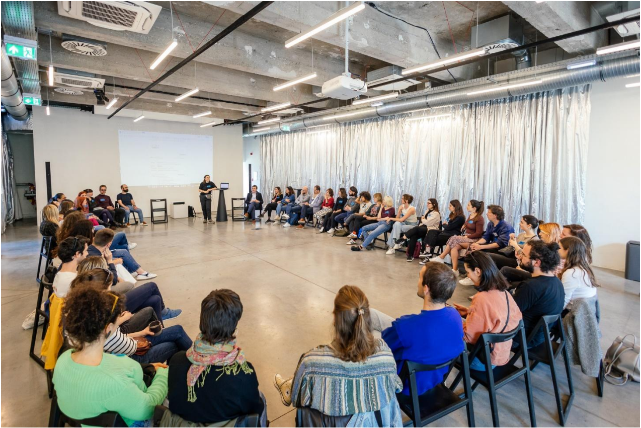
Plai Cultural Center, 08-05-2023