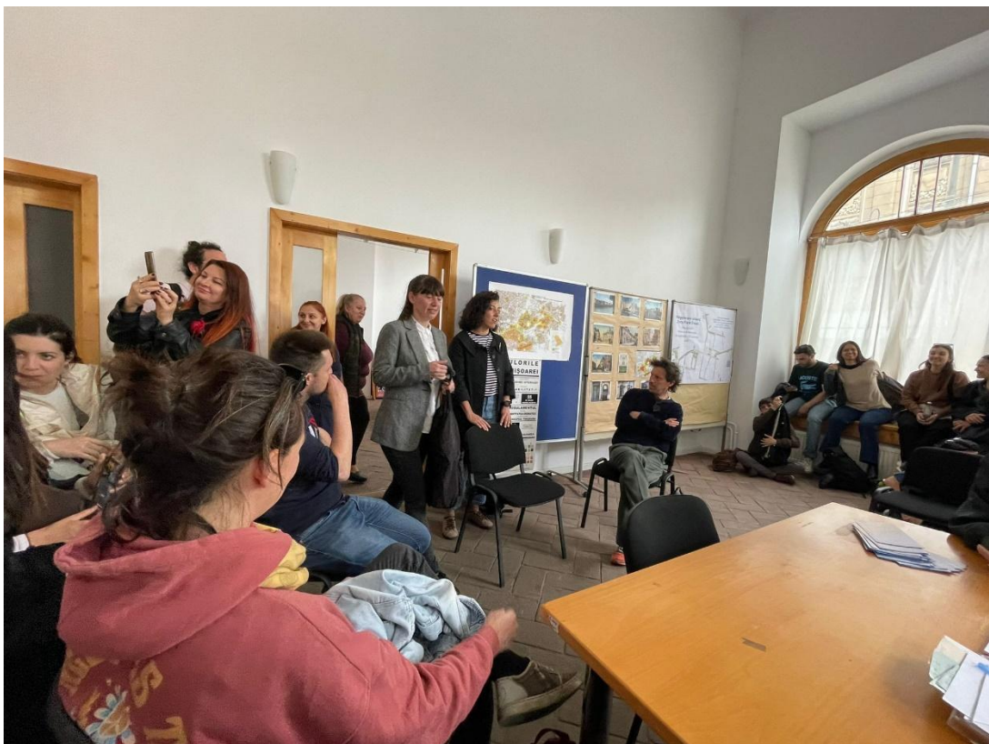
Office for the Rehabilitation of Historic Monuments. 11-05-2023