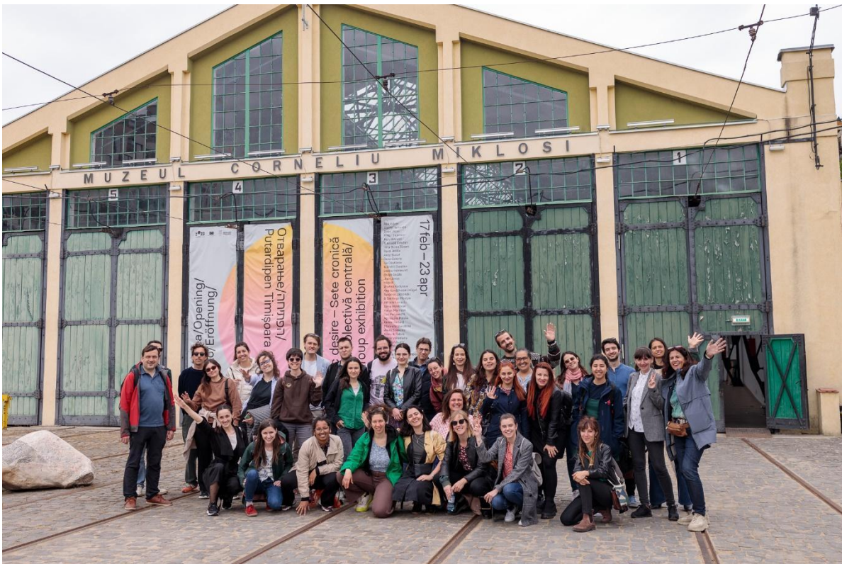
Museum of Public Transport and Multiplexity 11-05-2023