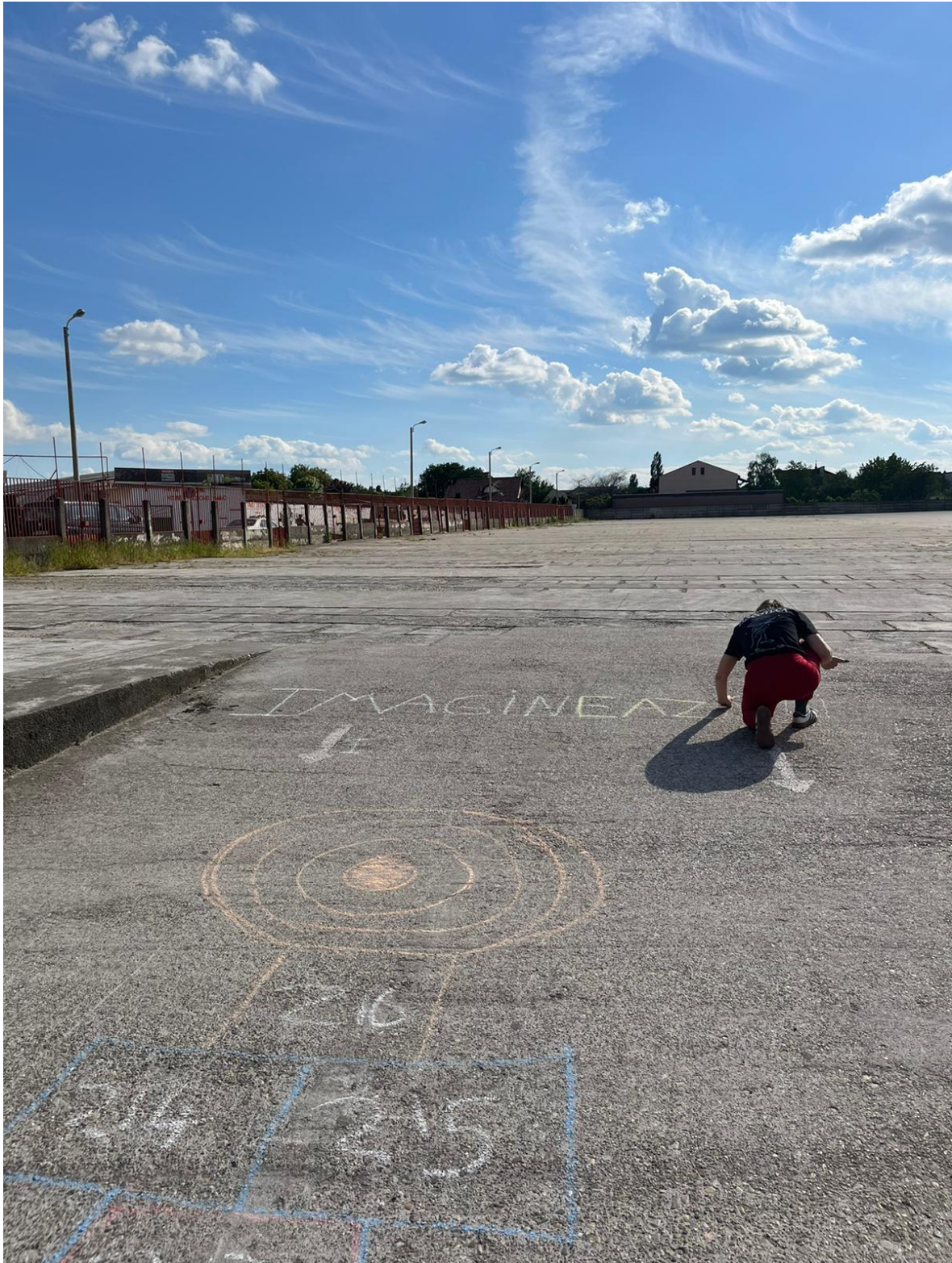
Interventions by mixed groups at Dâmbovița-Flavia neighborhood. 10-05-2023