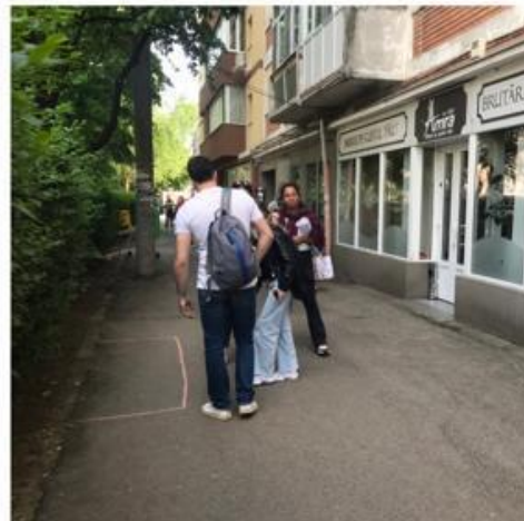
Interventions by mixed groups at Dâmbovița-Flavia neighbourhood. 10-05-2023