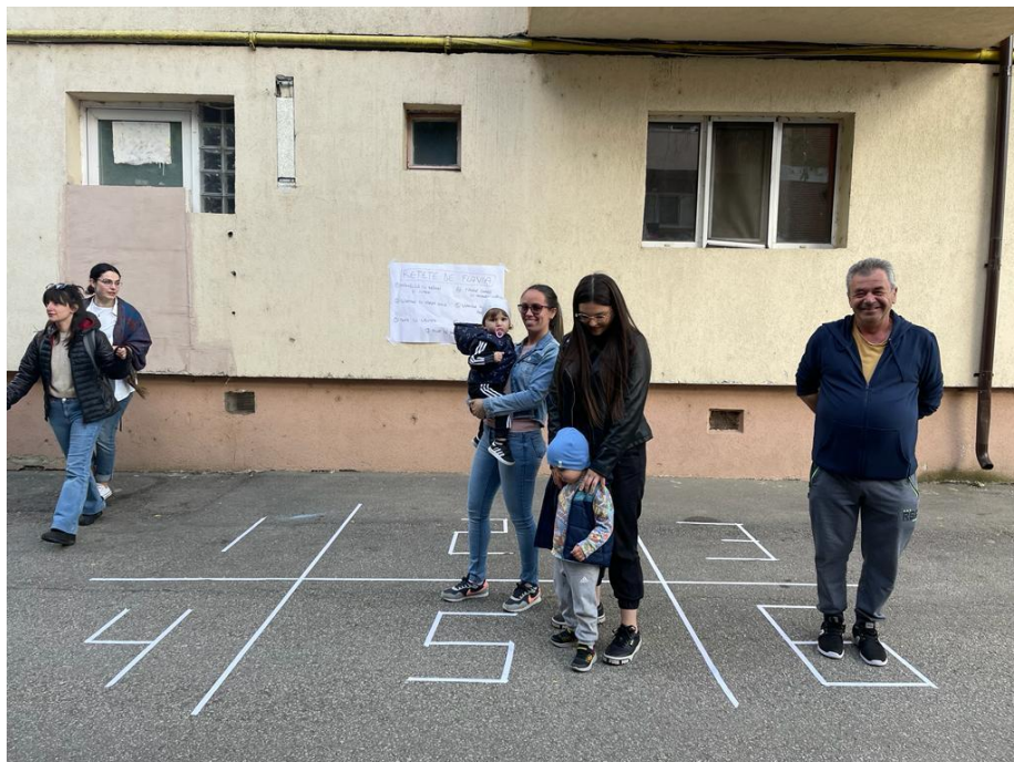
Interventions by mixed groups at Dâmbovița-Flavia neighbourhood. 10-05-2023